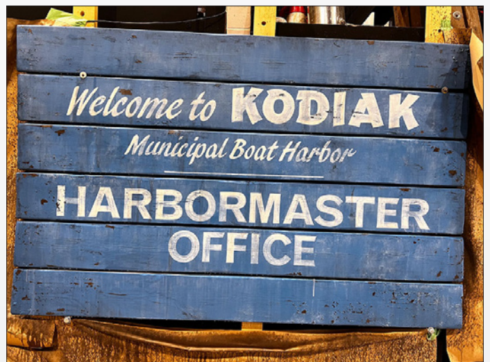
Alaska Daily S2