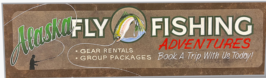
Alaska Daily 52

From my humble beginnings apprenticing as a signwriter in the early 1980's and after 23 years hand-lettering signs in Ireland, Malta, California, the Gulf Islands and Vancouver I became a member of the film union IATSE 891. The film industry is one of the few industries where traditional trade techniques are still being used. Replication of periods of the past require traditional signwriting in addition to techniques used to give the appearance of many years of harsh sunlight, rain, snow and oxidization that wears them down.