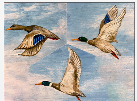
Mock 1950's Billboard : Client Private Residence