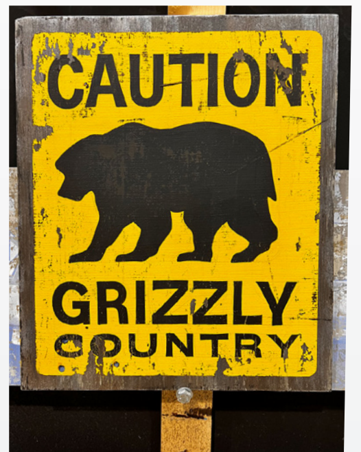
Alaska Daily S2