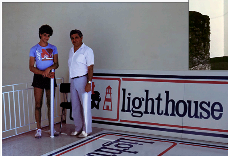
"Lighthouse Toys" Marsa, Malta, (1983) Hand lettered on plywood - 4'x 12' and 12' x 16'