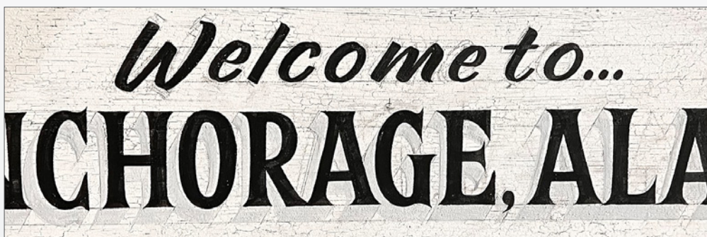
Alaska Daily 52

These aging techniques extend the creative possibilities of Interior Designers and Architects. Old signs or ghosted lettering on a brick wall in a Pub or Cafe create a sense of comfort in that they give the patron the sense "This establishment has been around a while".