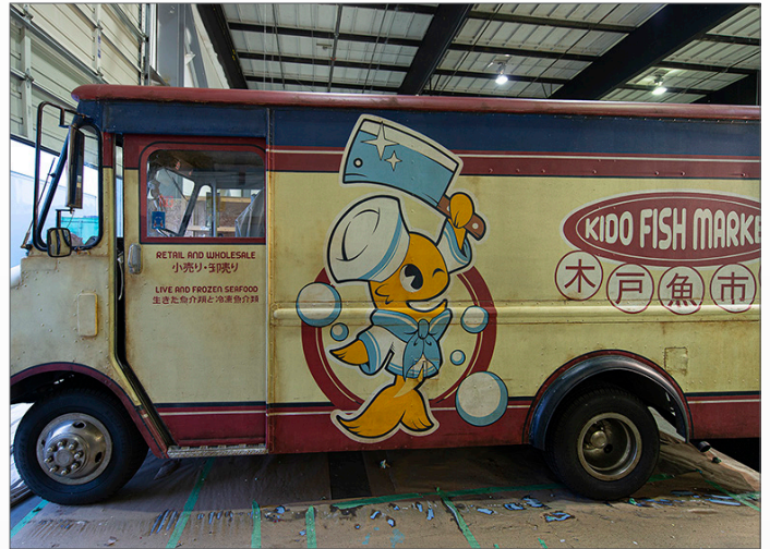
Step Up 5