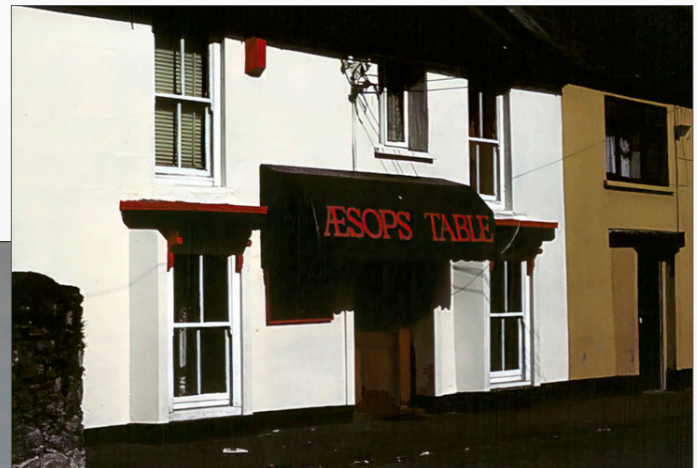
"Aesops Table" Ballincollig, Ireland, (1983) Hand-Lettered on Canvas Awning