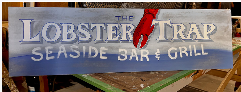
Alaska Daily S2