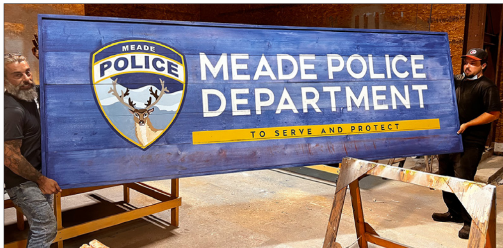
Alaska Daily 52

From my humble beginnings apprenticing as a signwriter in the early 1980's and after 23 years hand-lettering signs in Ireland, Malta, California, the Gulf Islands and Vancouver I became a member of the film union IATSE 891. The film industry is one of the few industries where traditional trade techniques are still being used. Replication of periods of the past require traditional signwriting in addition to techniques used to give the appearance of many years of harsh sunlight, rain, snow and oxidization that wears them down.